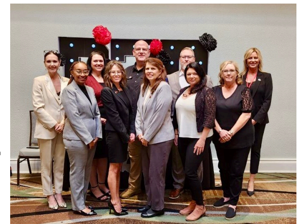
Destination Zero Deaths Regional Safety Coalition Coordinators